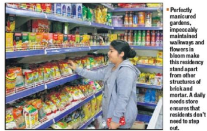
Perfectly manicured gardens, impeccably maintained walkways and flowers in bloom make this residency stand apart from other structures of brick and mortar. A daily needs store ensures that residents don't need to step out.