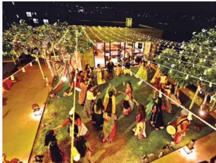
During Navratri, almost every society in Gurgaon will have a shopping arena, food stalls, etc (picture only for representational purpose)

Over 7,400 teachers will be recruited in Haryana soon